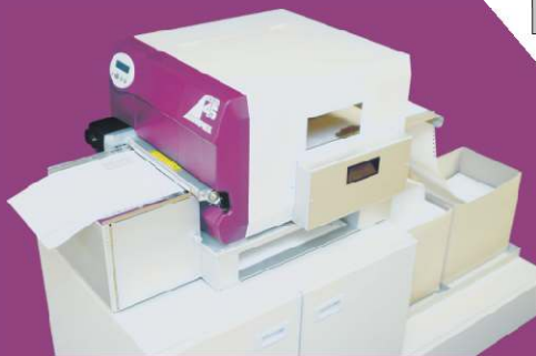
Standard: single tractor version